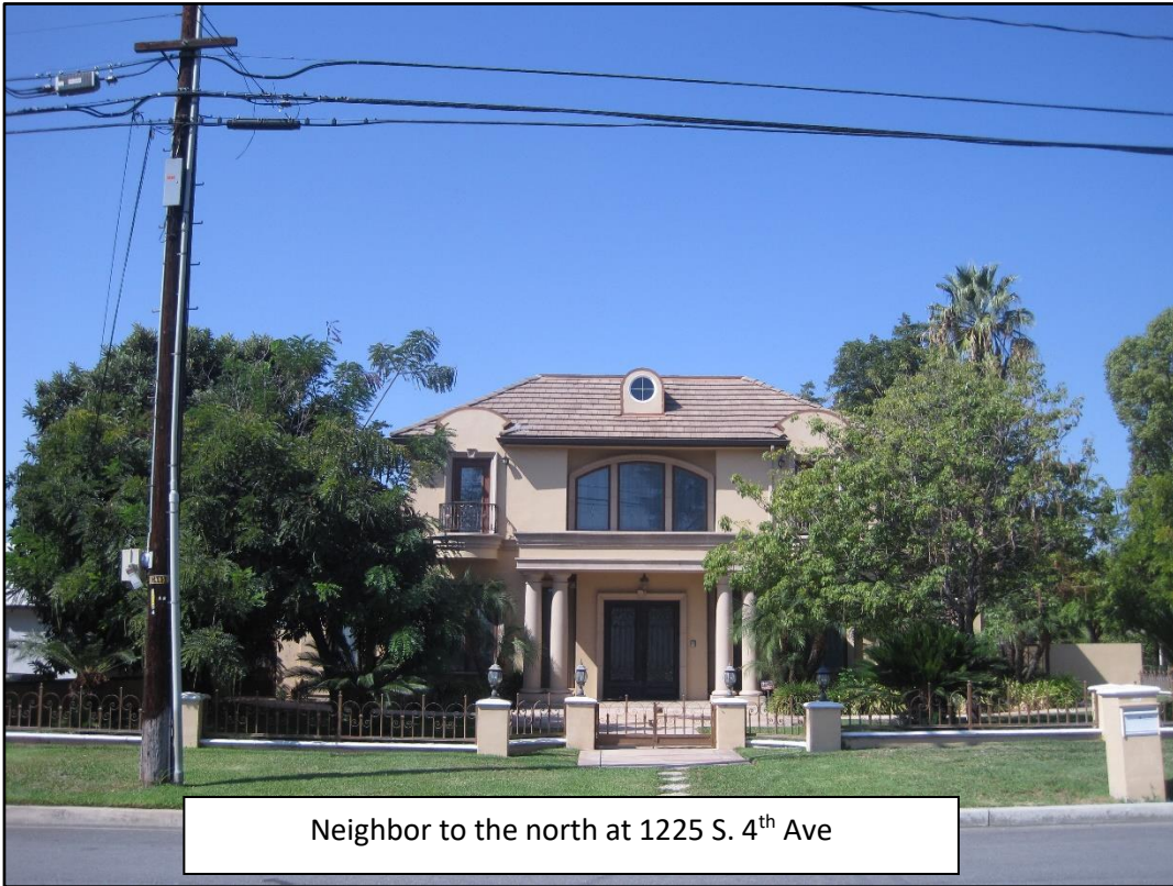
Neighbor to the north at 1225 S. 4 th Ave