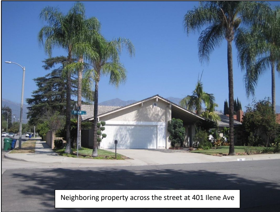
Neighboring property across the street at 401 Ilene Ave