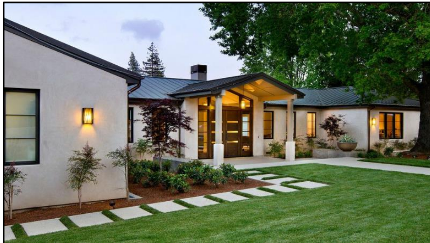
Figure No. 4: New Farmhouse style

However, the use of the standing seam metal roof has grown in popularity. The material has been used on residential homes to give it more of a contemporary look, on modern homes, and on new modern farmhouse architectural style homes – refer to Figure No. 4 for a picture of a new developed house with this roof. The material is considered for its durability, affordability, and low maintenance.