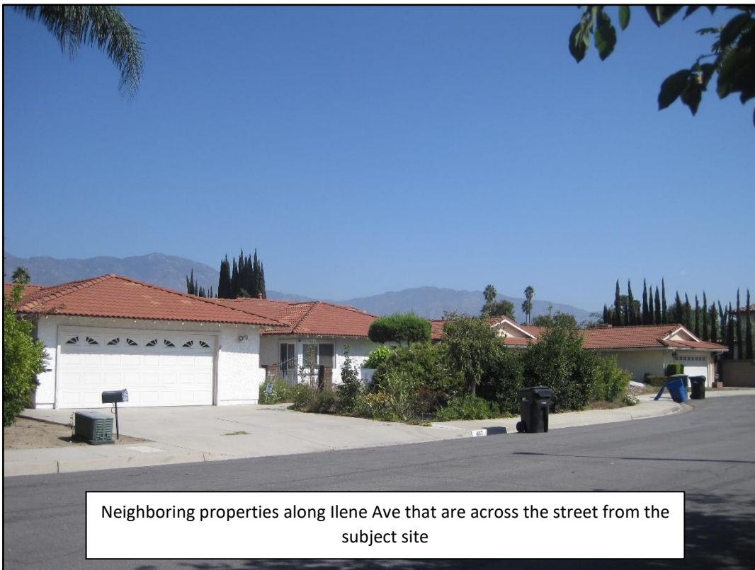
Neighboring properties along Ilene Ave that are across the street from the subject site