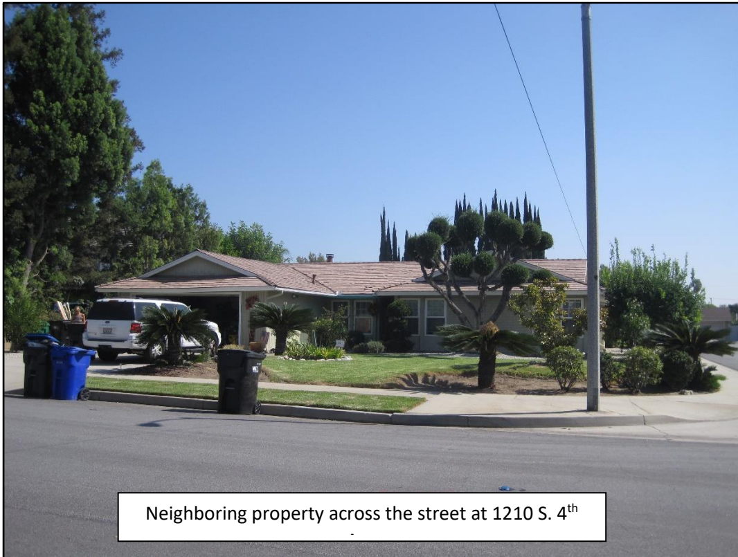
Neighboring property across the street at 1210 S. 4 th