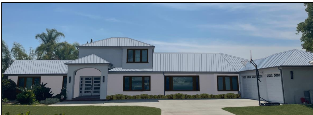
Figure No. 3: Rendering of proposed façade improvements.

The proposed standing seam metal roof is manufactured by Western States Metal Roofing in the Matte Musket Gray (medium gray) color. Along with the new roof, the property owner is also proposing to change the color of the windows frames from white to black and paint the red brick white to modernized appearance of the house and try to complement the proposed metal roof – refer to Attachment No. 3 for the product information on the metal roof and a rendering of the façade improvement and Figure No. 3 below. The rendering below does not provide an accurate depiction of the colors but is included for visual reference of the area in change. If approved, the property owner intends change the accessory dwelling unit (ADU) facade to match the main house (in terms of colors) as well as the roof. The roof for the ADU has not been purchased yet.