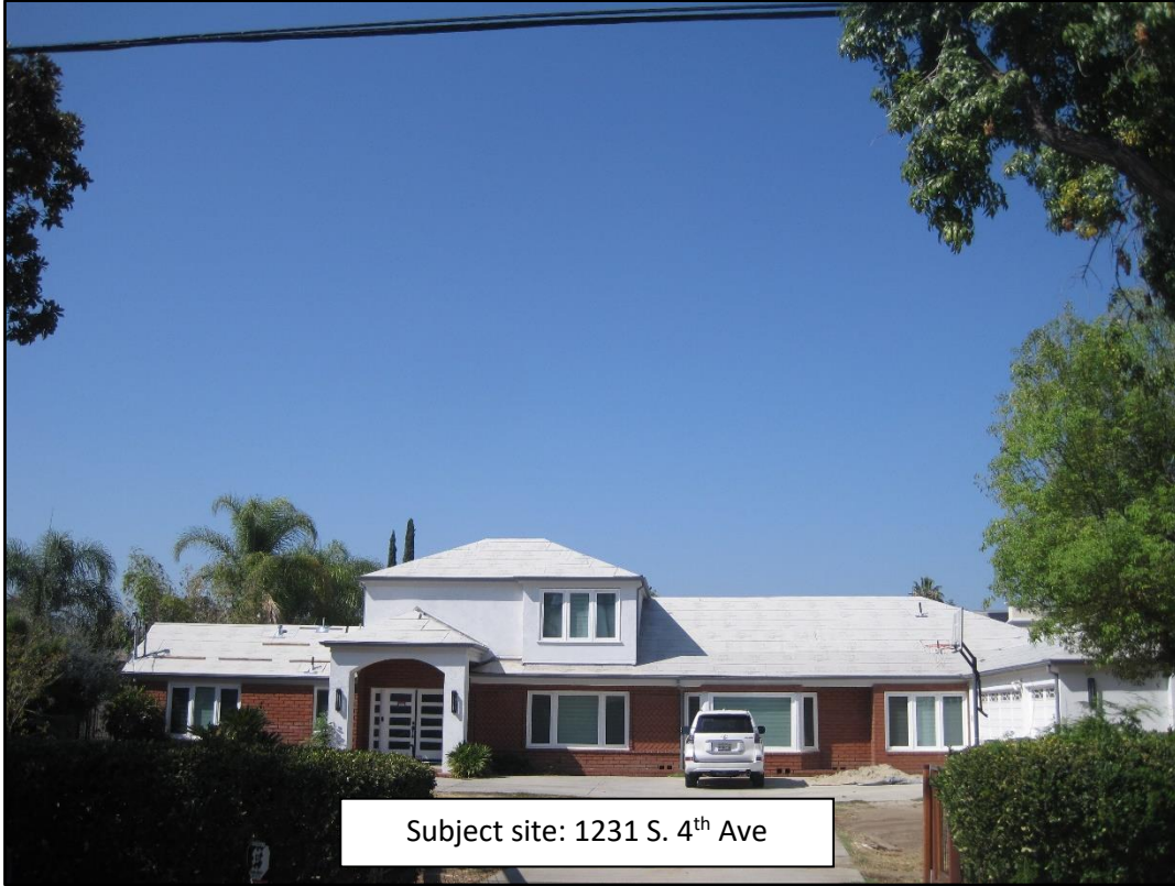
Subject site: 1231 S. 4 th Ave