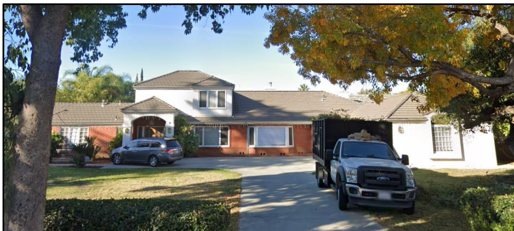
Figure No. 1: A Google street view of the house with the previous tile roof.

Staff recently became aware that the tile roof on the house was removed in May/June and only the roof underlayment was left – refer to Figure No. 1 for a street view of the house with the previous tile and Figure No. 2 for a street view of the house without the roof. Since the work was done without a building permit, a stop work order was issued on October 4, 2022. A roofing permit must be obtained as soon as a decision is rendered by the Planning Commission on the roof material.