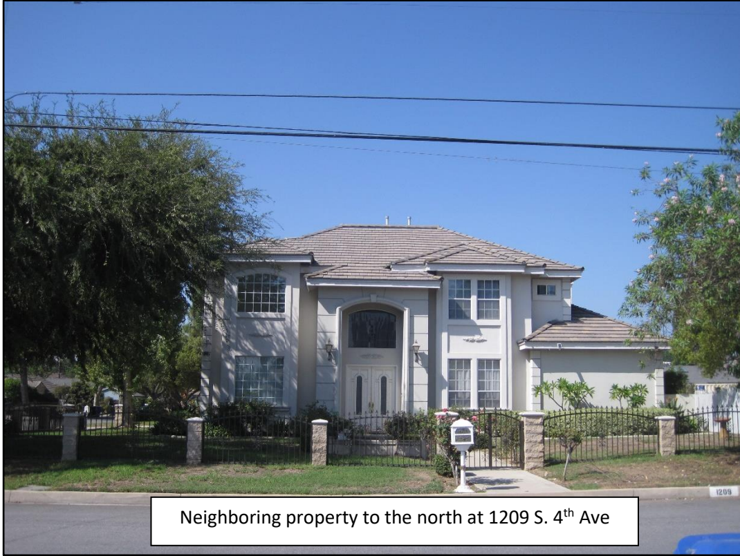
Neighboring property to the north at 1209 S. 4 th Ave