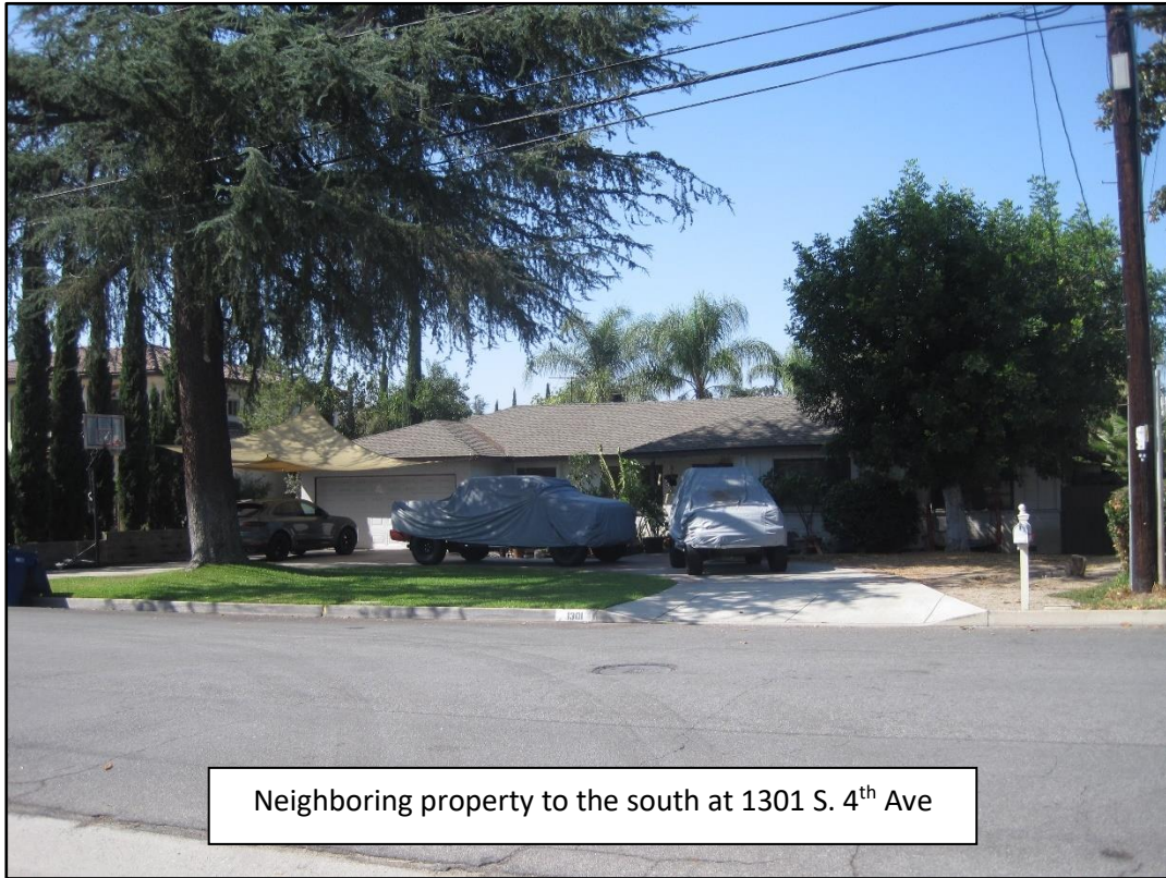
Neighboring property to the south at 1301 S. 4 th Ave