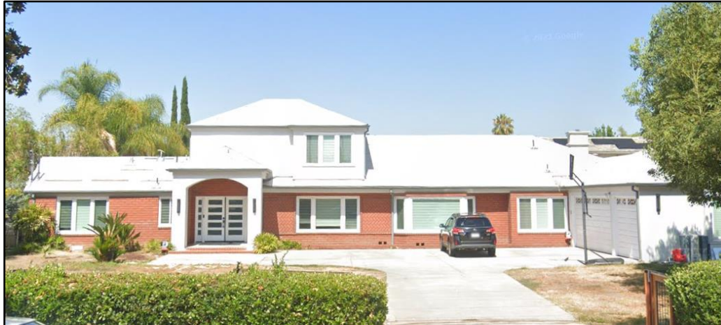
Figure No. 2: The current condition of the house.