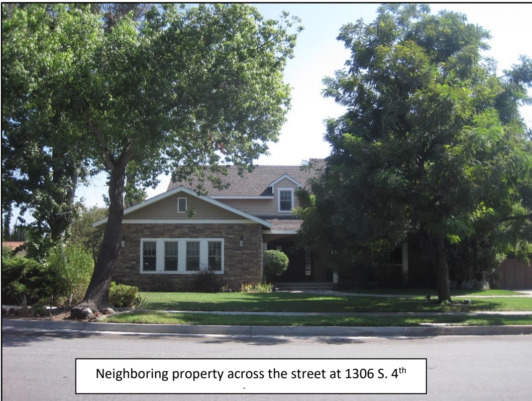
Neighboring property across the street at 1306 S. 4 th