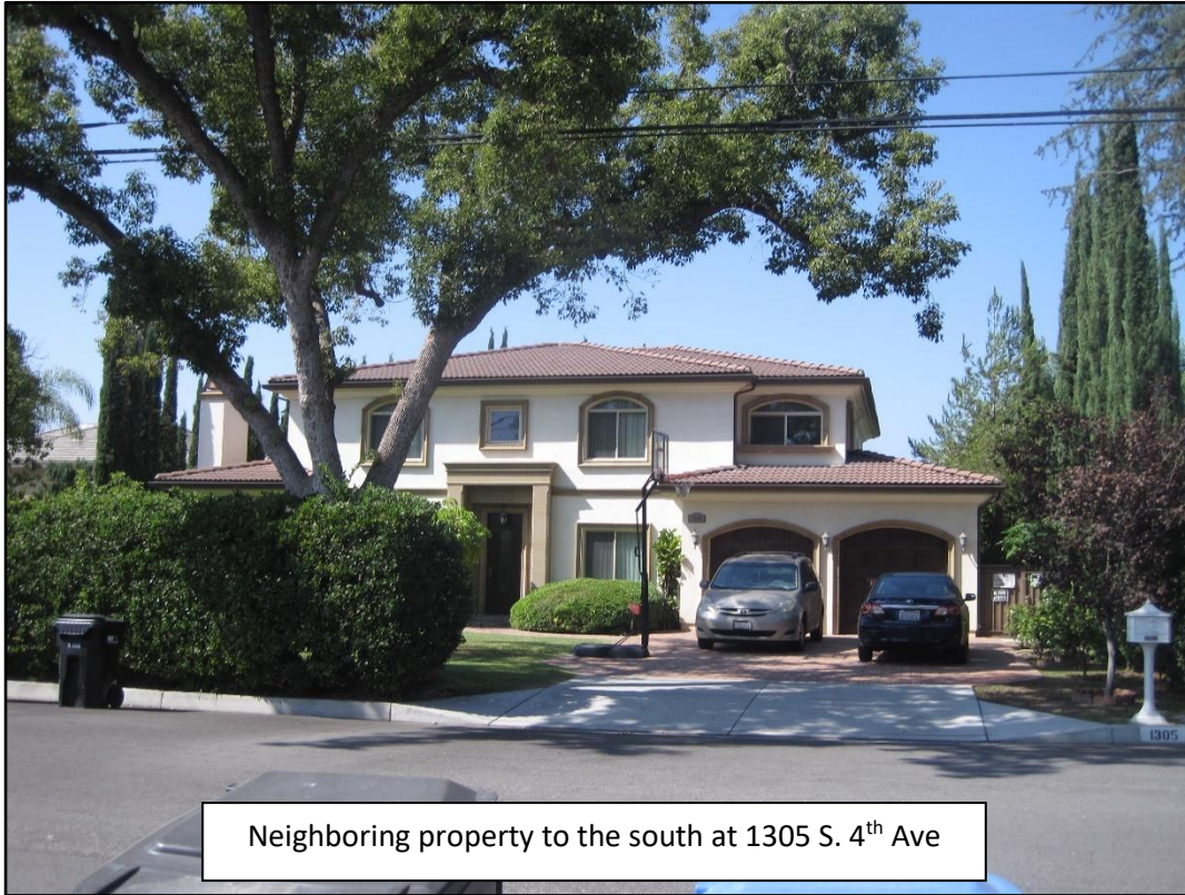
Neighboring property to the south at 1305 S. 4 th Ave