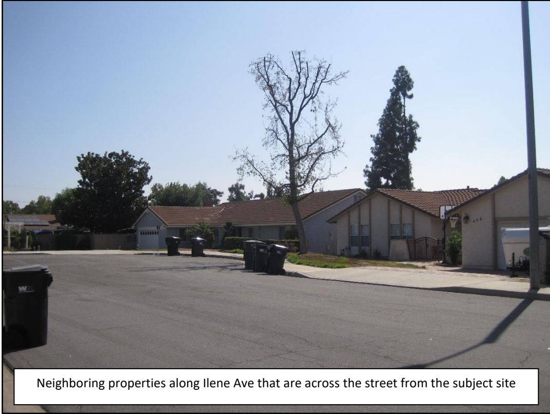
Neighboring properties along Ilene Ave that are across the street from the subject site